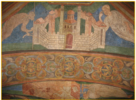
Heavenly Jerusalem, ca. 1173, St. Maria and St. Clemens church, Schwarzrheindorf, Germany