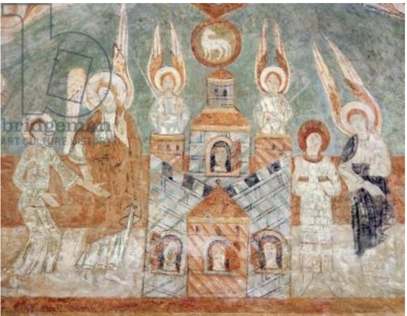
Christ in Majesty and the Heavenly Jerusalem, ca. 1120, Abbey Church of Saint-Chef, France

April 25 – 26, 2013 Loyola University Chicago, Lake Shore Campus Coffey Hall – McCormick Lounge